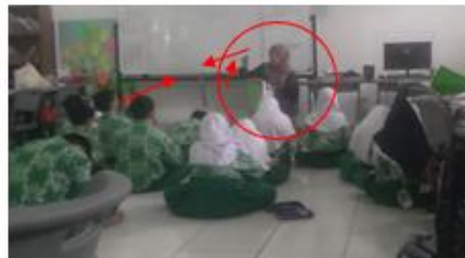
Figure 4 : Teacher' Iconic Gesture in the Material Mode