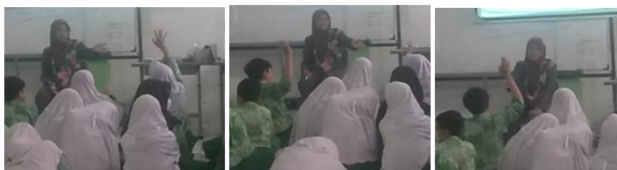
Figure 1: Teacher's Gaze and Gestures as a Means for Nominating a Student

Furthermore, the extract above also indicates Ica's classroom interactional competence. In this light, the used teacher echo, i.e. she repeated the utterance of the student's response (see line 7 of extract 1), is in conformity with the interactional feature that is commonly utilised in the skills and systems mode (Walsh, 2006a, 2006b, 2011). In this case, it is deemed a significant means of amplifying the student's response through which the other students learn too (Walsh, 2002).