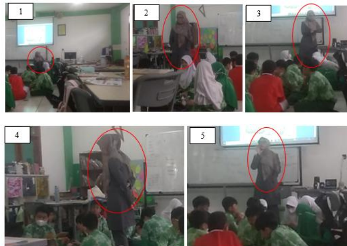
Figure 5 : Teacher's Use of Embodied Actions to Monitor Students