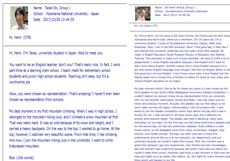
Figure 3. Student's Writing Published in Project Ibunka and Reader's Feedback

As shown in figure 3, a student's final writing was posted in Ibunka Forum and it was read by audiences from different institutions and countries. The writing got comments, feedback, critics as well as supports from the audience. However, the feedback did not change anything since the comment and feedback given focused on the content of the writing, not on the form. In this case, the students had experience of accepting different opinions about an issue from the audience who had various backgrounds.