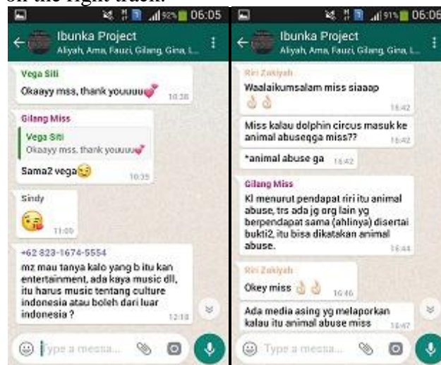
Figure 2: Students Discussing Their Writing Planning through Conversation in Whatsapp group