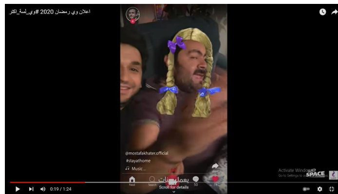
Figure 3: Telecom Egypt Commercial: Snapchat live video layout

In fact, this pervious voice-over shed light on the uniqueness of the time of Ramadan 2020 being a time where people had to stay home and abide by the state lockdown regulations while sustaining a positive attitude. Commercial 3 succeeded in depicting possible feelings of boredom and annoyance people might have felt during the lockdown and lists its company's promotion at the end of the commercial in an attempt to tell their viewers that the company felt for them and that it aimed to make its customers feel together while physically apart. In this sense, Etisalat Egypt adopted the stay home metaphor while depicting fun activities that could be done at home despite possible feelings of annoyance and, at the same time, promoting their exceptional internet plans that would appeal to its customers during the lockdown period.