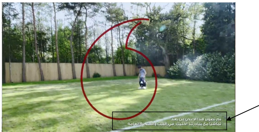
Figure 1: Commercial 1-Vodafone Egypt: Disclaimer

In addition, the commercial’s jingle revolves around the idea of “ we are still together although we are currently physically apart ” and was supported by the visual images of celebrities like Mohammad Salah, the Egyptian footballer, playing with his daughter, attending online school events, and sharing online challenges on his social media accounts with his fans. Other visual images in this commercial included Cairokee and Sharmoofers 1 lead singers working together online, television presenter Esaad Younis shooting her talk show via video conferencing, and people having iftar together through online video conferences as well. At the end of the commercial, the viewer could listen to a voice-over reading, “ As long as we are there supporting each other, nothing can keep us apart, ” where the word nothing referred to the pandemic. In this way, Vodafone Egypt’s commercial included the idea of the pandemic and the necessity of staying safe at home by reinforcing the notion of how people can still enjoy their lives while remaining safe and maintaining social distance to limit the spread of the pandemic.