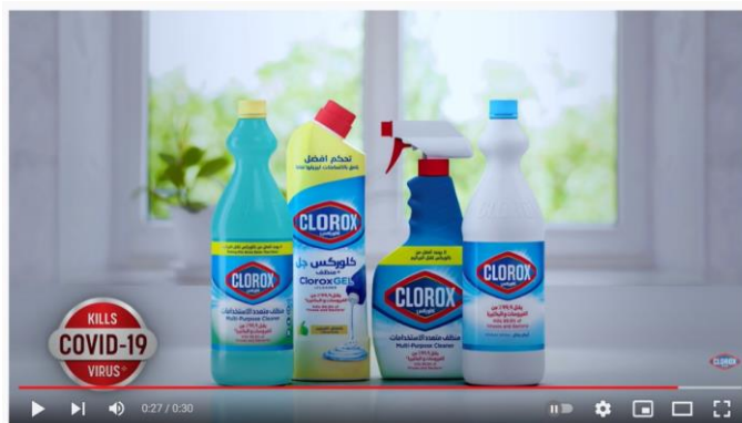
Figure 5: Commercial 8-Clorox: Kills Covid-19 badge

Although the theme of the pandemic is depicted, Commercial 8 of Clorox did this on a lighter note by focusing more on the visual images. The ad started with a teacher wearing a mask cleaning class desks and welcoming students, all with masks on as well, to class. The rest of the advertisement featured people cleaning different places with Clorox products, accompanied by a voice-over thanking everyone who encouraged others and made things easier for people.