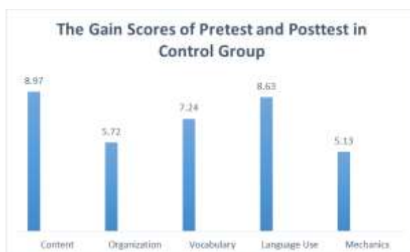
Figure 1: The Gain Scores of Pretest and Posttest in Control Group

An analytic scoring rubric of ESL Composition Profile developed by Jacob et al (1981) was applied to show the quality of five writing aspects: content, organization, vocabulary, language use, and mechanic. The results showed an increase in each aspect of students' composition in the traditional class. The most significant gain made by traditional class was in their scores for content (8.97), followed by language use (8.63) and vocabulary (7.24). The gains score for organization and mechanics are considered moderate. The following figure presents the gain made by students in control group.